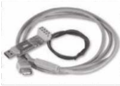
KEYSCAN-USB-SER USB Communication Adapter