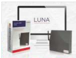
KEYSCAN-SDAC Luna Single Door Controller