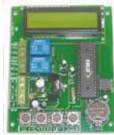
Batteries & Timer For 10-5 Power Supply